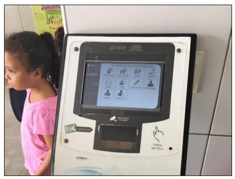
Appendix 4 Evaluation Terminal at Public Health Clinic