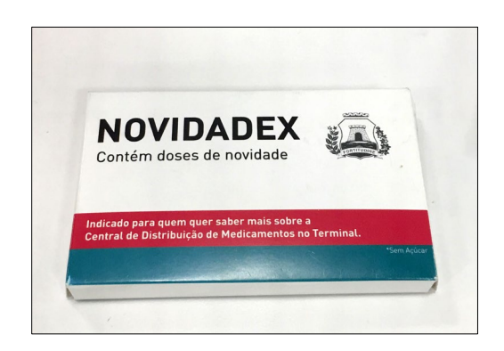
Appendix 6 Chewing Gum Faux "Medication Package"

Fake medication boxes with chewing gum inside were distributed to educate the public health clinic staff.