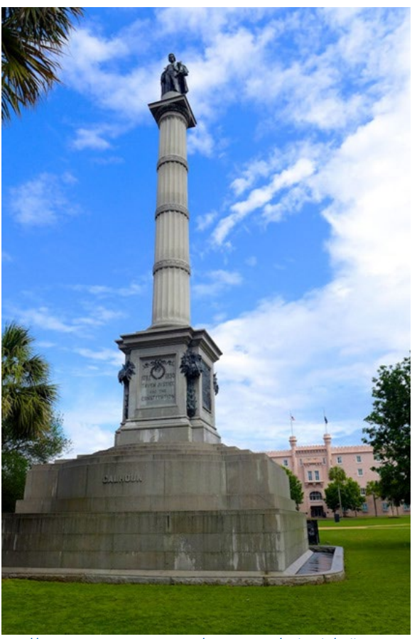
Appendix 2 John C. Calhoun Monument in Charleston, South Carolina

Photo by Andy Hunter. Source: <a href="https://www.scpictureproject.org/wp-content/uploads/calhoun-monument.jpg">https://www.scpictureproject.org/wp-content/uploads/calhoun-monument.jpg</a>. Used with permission.