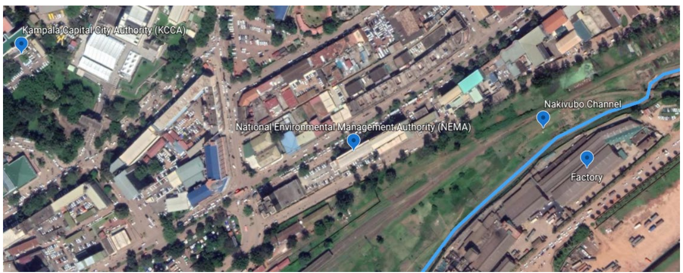
Location of factory vis-à-vis the National Environmental Management Authority, the Nakivubo Channel, and KCCA headquarters