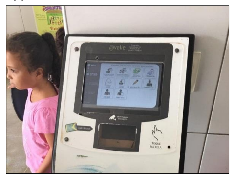
Appendix 4 Evaluation Terminal at Public Health Clinic