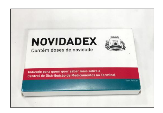
Appendix 6 Chewing Gum Faux "Medication Package"

Fake medication boxes with chewing gum inside were distributed to educate the public health clinic staff.